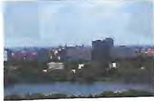
Cityscape of Nuremberg with the Federal Labour Office in the foreground.