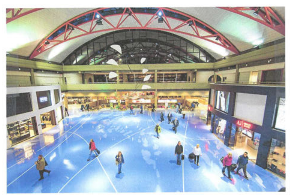
Like its predecessor, the new airside terminal included an Alexander Calder mobile above the main concourse.