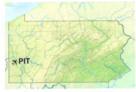
Location of airport in Pennsylvania