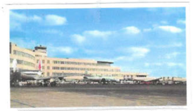
The long decline of the once-thriving Pittsburgh International Airport