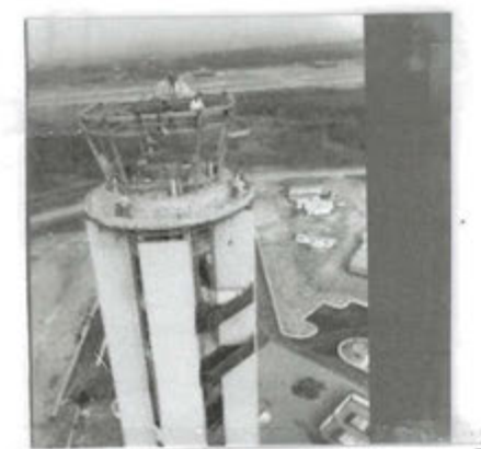
Construction of PIT Control Tower a Milestone in Airport History